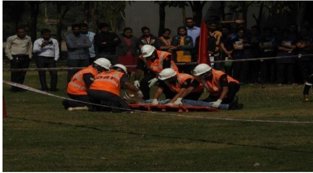
Fast learners attending group discussion and mock drill on various topics