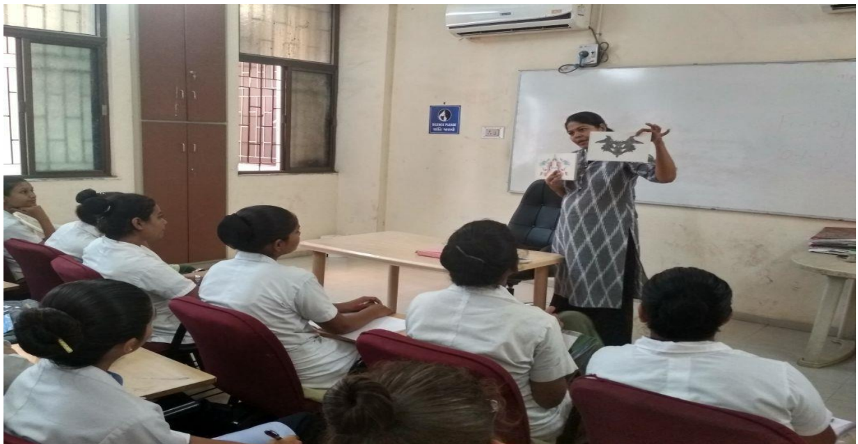
Expert sessions for fast pace learners