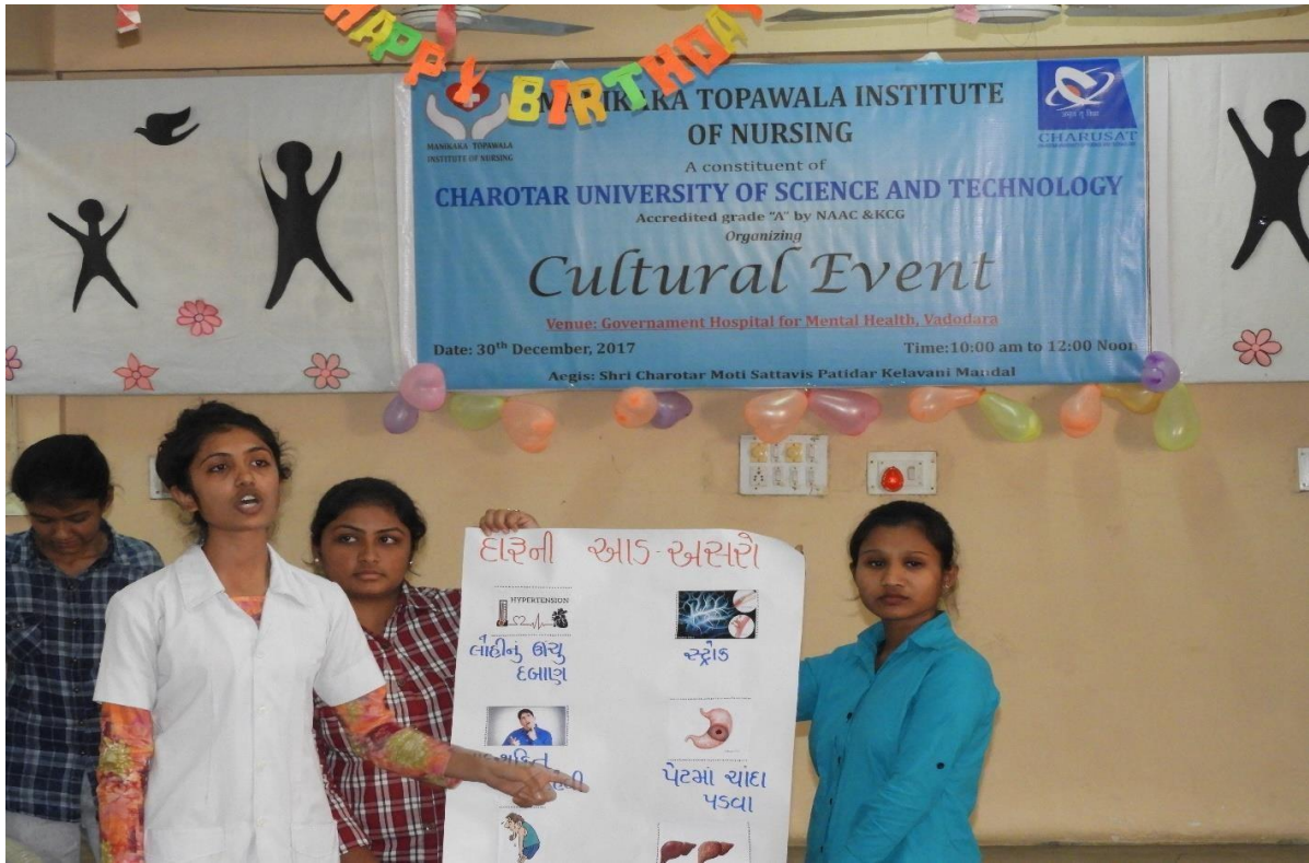
Health awareness camp from fast pace learners