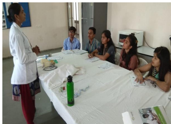
Hands on training and panel discussions organized for fast learners.