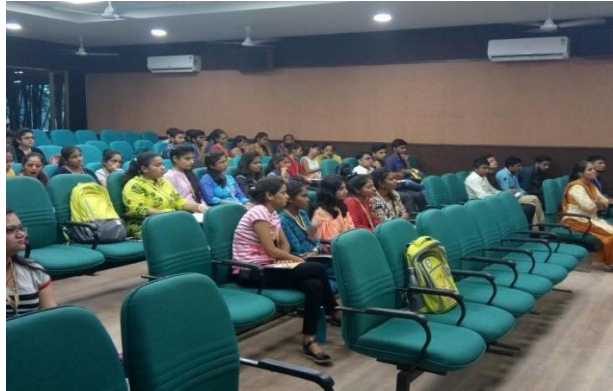
Workshops organized on topics like research methodology and other curricular topics